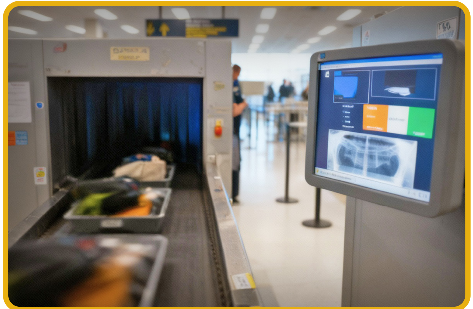
An X-ray machine at an airport

During the mental scan exercise, the Sailor uses their own thoughts as the focal point. The thoughts can range from moments of frustration to feelings of self-doubt or anything that does not allow the Sailor to focus. The Sailor takes a moment to observe the thought objectively, and then lets it go from their mind. For example, if a Sailor is studying for a promotion, and their thoughts are wrapped up in their inability to qualify previously, a quick mental scan will rid them of negative self-talk or hindering thoughts, allowing them to engage in flexible thinking