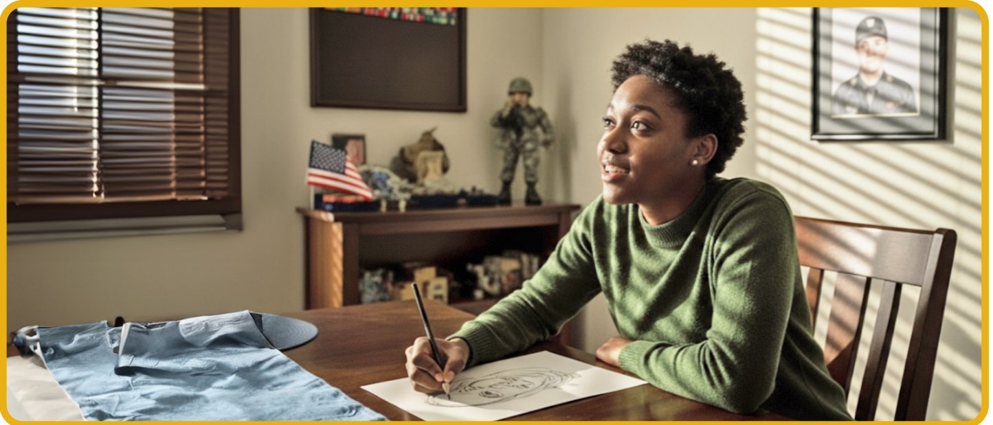
An individual focuses on sketching a portrait