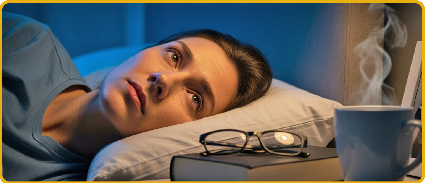
An individual practicing mindfulness in bed

intentional recovery they require to relieve their tension and make it easier to focus on the target.