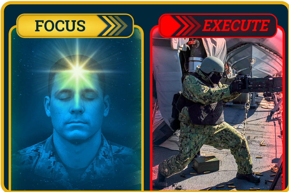
A Sailor centered in mindful awareness at sea