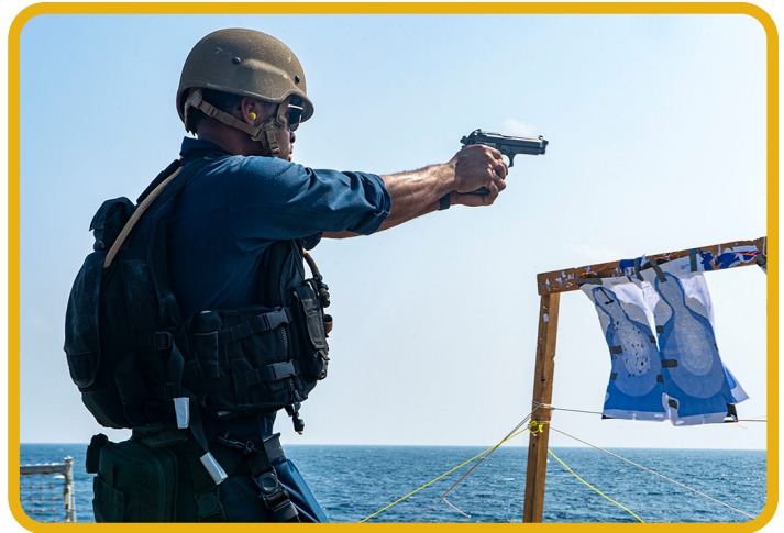
A Sailor on a firing range

Practicing mindfulness provides a way for Sailors to recover from stressful situations as it triggers a relaxation response in their bodies. It is common for Sailors to put themselves last when they are constantly on the move, and their bodies can break down over