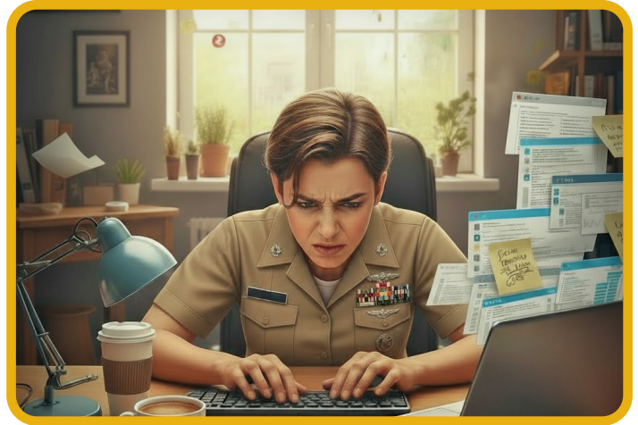
A Sailor distracted by competing demands

With practice, mindfulness will become second nature for Sailors.